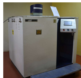
Gamma Chamber GC 5000