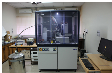
Single Crystal XRD