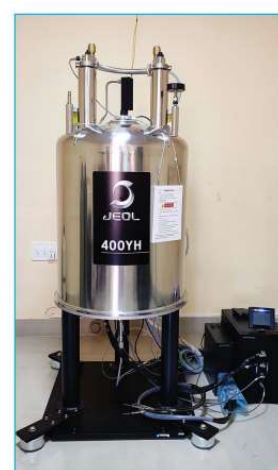
NMR SYSTEM Model/Make: Jeol, JNM-ECZ400S/L1, Japan