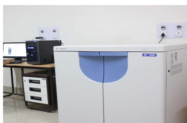
Amino Acid Analyzer